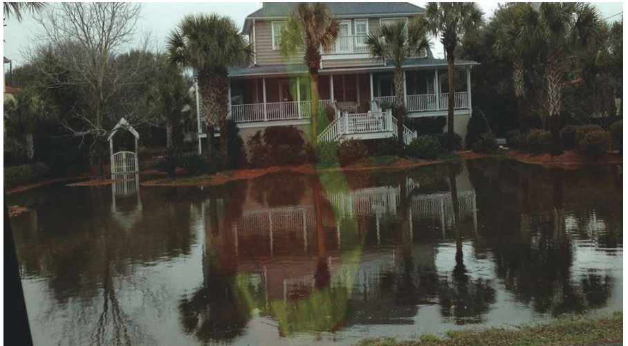
Sealing the collection system provided a bittersweet result: standing water after a rain. Previously, stormwater runoff was aided by the porous sanitary system, which swept away surface and groundwater to the wastewater treatment plant at high-expense to the ratepayer.